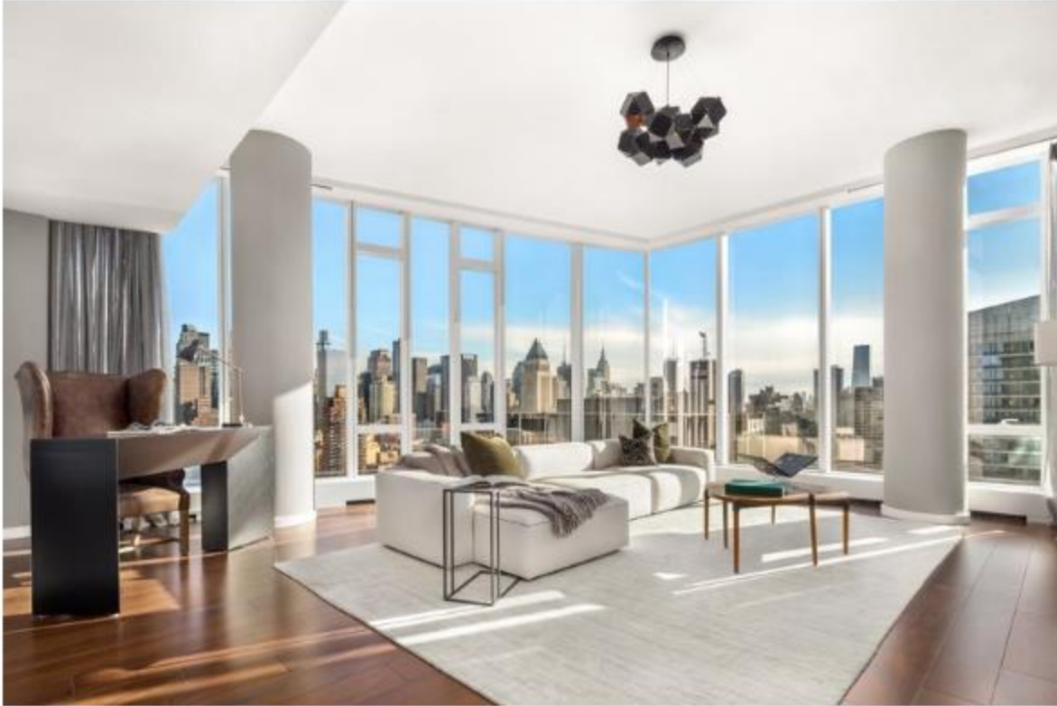
The view from a duplex at One West End, where Lopez is filming her new movie, Hustlers .