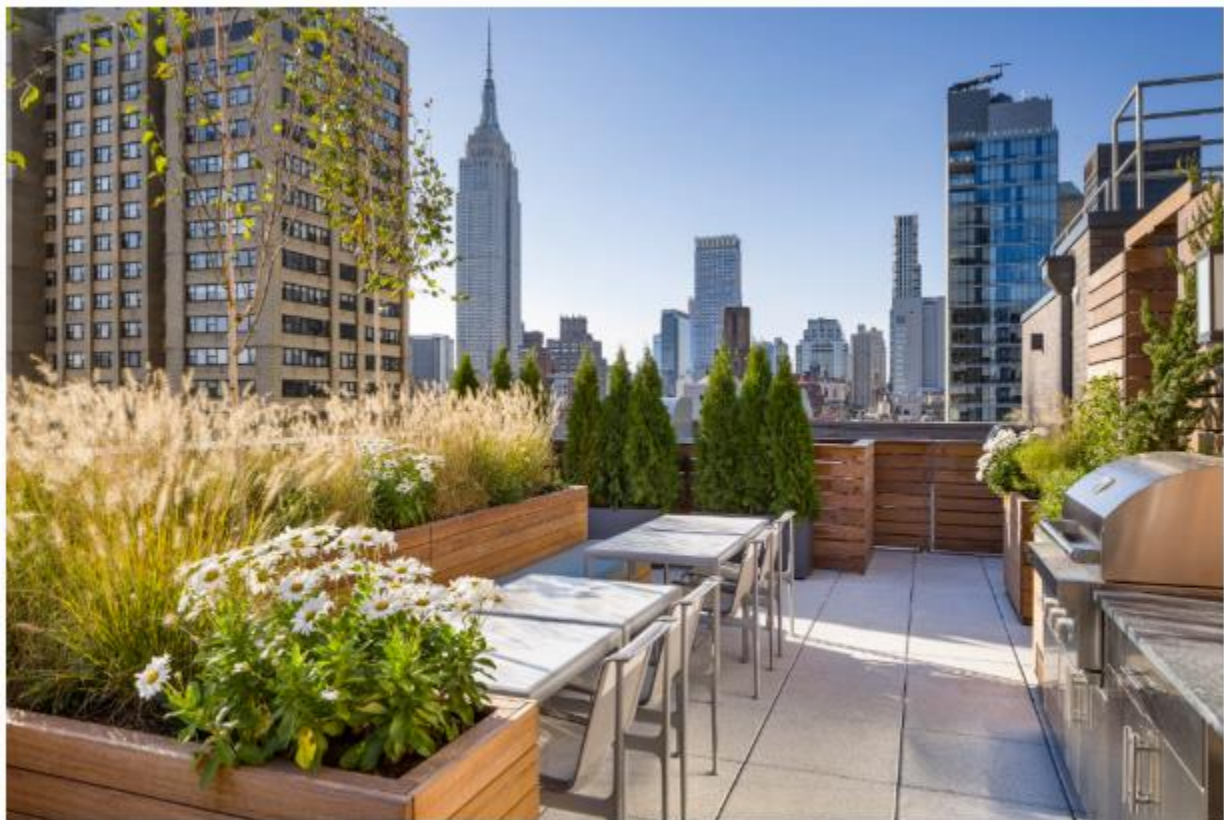
The Lindley PHB THE MARKETING DIRECTORS

It may be taking a little longer to arrive in the northeast than other places, but spring is on its way. Since it's more difficult to enjoy the outdoors when you live in an apartment building, gardens, terraces and other places to catch fresh air at home become especially treasured.