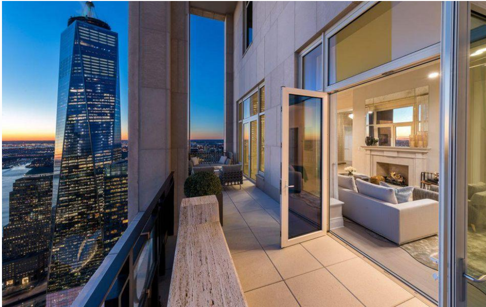
30 Park Place PH78B Four Seasons Private Residences